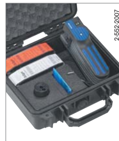
accuro® Hard Side Kit