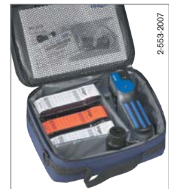
accuro® Soft Side Kit