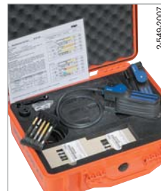
Civil Defense Simultest (CDS) Kit