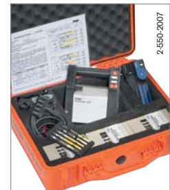
CDS/HazMat Kit with Quantimeter