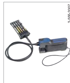
Simultaneous Test Set